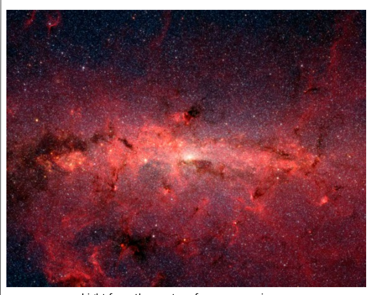
Light from the center of our superuniverse From the Hubble- the center of the Milky Way

unimagined by our starry-eyed ancestors.