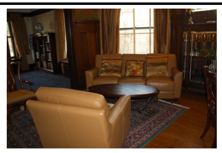
2nd floor living room

• Replace three outdated computers at the Foundation.