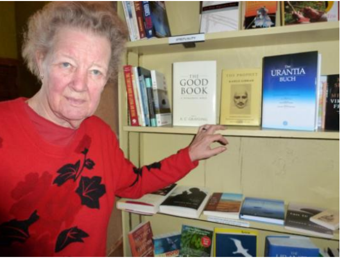
Bacchus Books in Golden, B.C., Canada . The Urantia Book has been sold there for years.