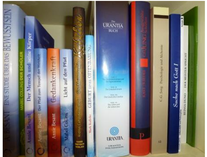
Buchhandel im Licht, a bookstore in Zurich, Switzerland . The Urantia Book is placed next to C.G. Jung's book. The French and Italian translations can be found in another section in this store.