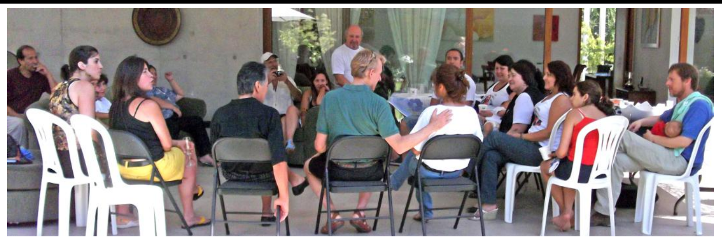
Discussing Urantia Book teachings with Santiago readers

study groups. Books are expensive. Paperbacks sell for $70-80 US. The group was very vocal about the high prices and felt it should sell between $30-40 US. They accounted for the price being so high because of a 19% value added tax and a 9% import duty. I explained that Urantia Foundation wanted fair prices, and that we sold paperback books to our Latin American distributor for $10 US.