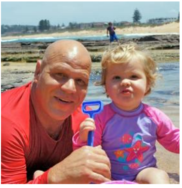
A Moment in Time