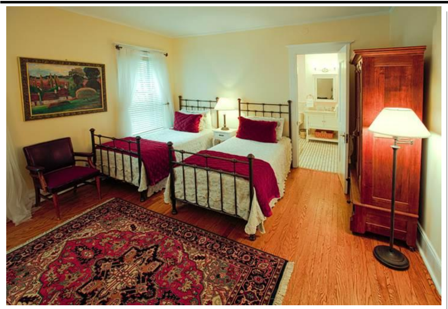
A renovated second-floor bedroom