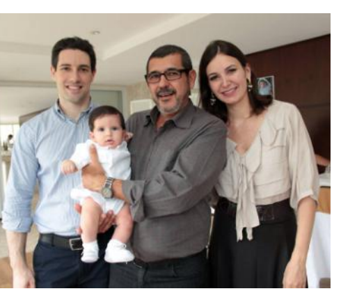
Planned giving is a family affair.

We hope this online tool will be a useful service to supporters of Urantia Foundation, and that, as you think about estate planning, you will consider remembering what The Urantia Book has meant to you by remembering in your will Urantia Foundation, the original publisher and distributor of the book worldwide.