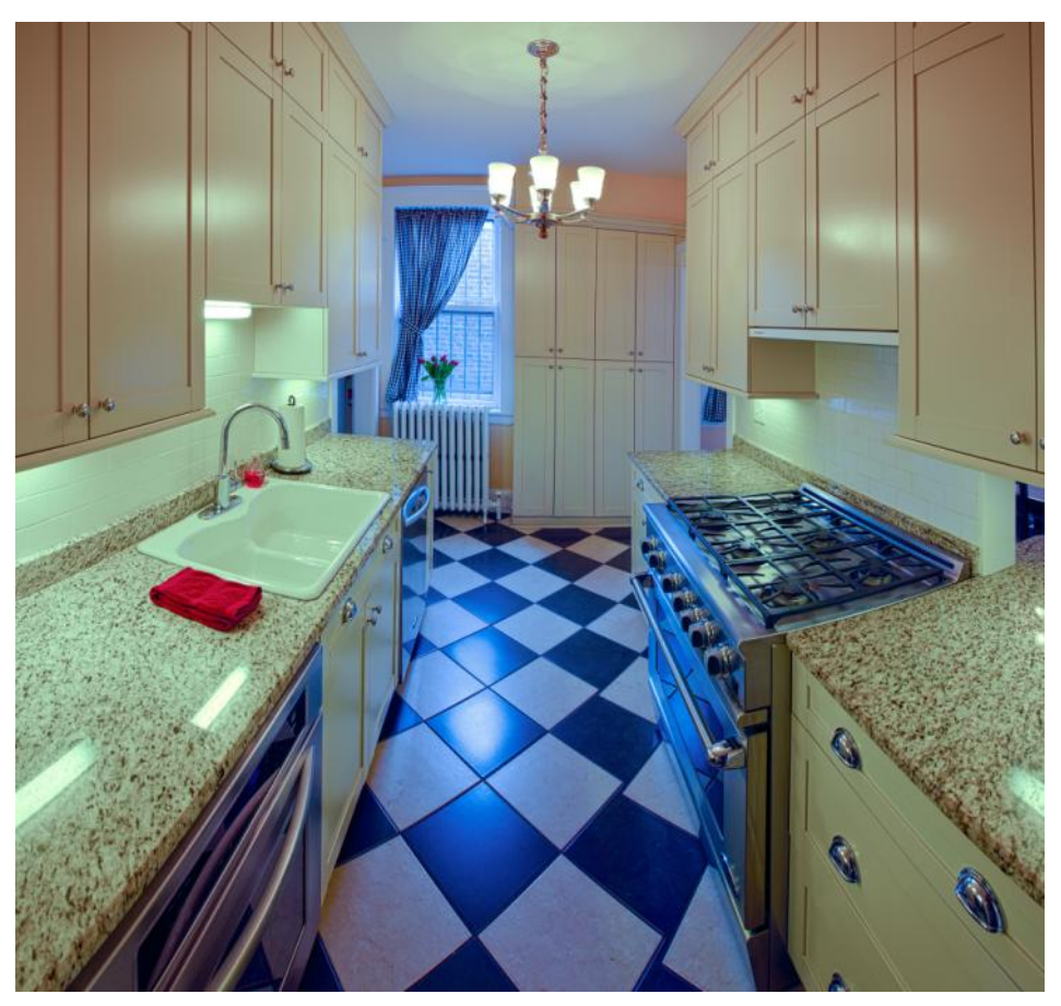
The renovated second-floor kitchen