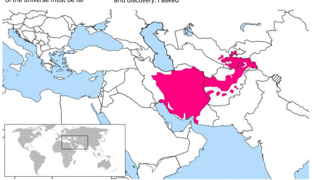
Persian language map

What a delight and honor it is to be a translator of The Urantia Book and to be here on Urantia when, as is stated in the book: "All Urantia is waiting for the proclamation of the ennobling message of Michael, unencumbered by the accumulated doctrines and dogmas of nineteen centuries of contact with the religions of evolutionary origin. The hour is striking for presenting to Buddhism, to Christianity, to Hinduism, even to the peoples of all faiths, not the gospel about Jesus, but the living. spiritual reality of the gospel of Jesus." (1041:5) 94:12.7