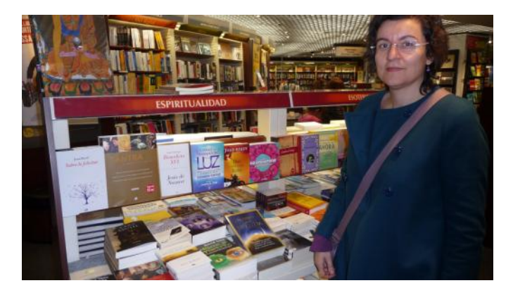
By Olga López, Barcelona, Spain

The Urantia movement is growing slowly and steadily in Spain. The book is easy to find and order, and its price (thirty euros) is affordable if we take into account that any best-selling book costs about twenty to twenty-five euros. Recently, I went to a FNAC bookstore in Barcelona, and, to my surprise, they had about thirty copies of The Urantia Book in plain sight! Book distribution has come a long way since the time when the book was available only in a few esoteric bookshops, and it was next to impossible to find on the shelves.