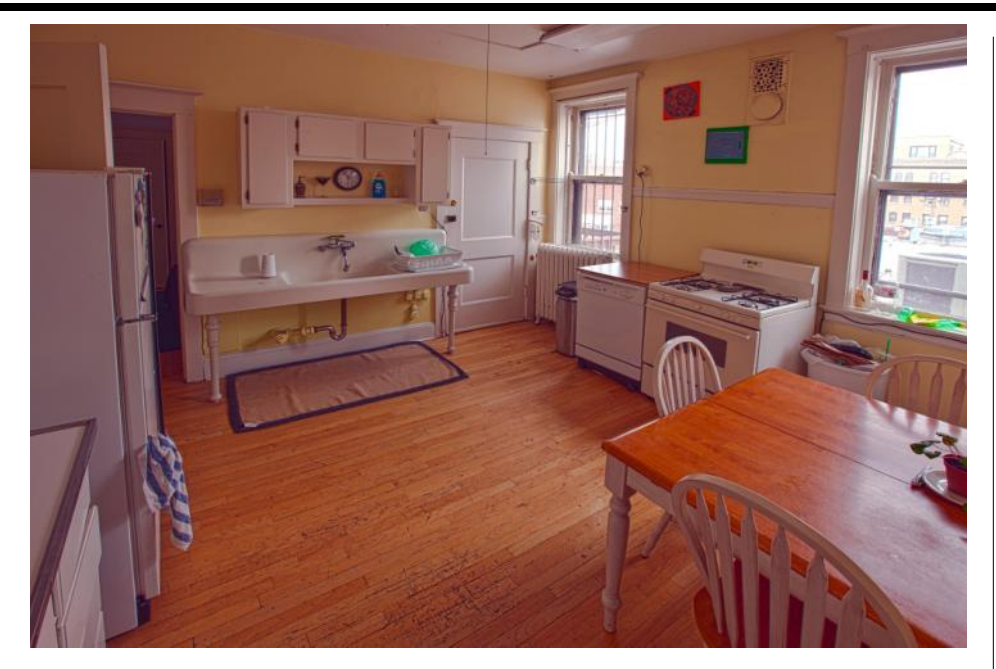
The third-floor kitchen

The historic 105-year-old Chicago home of the Urantia Revelation has undergone extensive renovations on the first and second floors. This year the third floor, the attic, and possibly the carriage house will be renovated. The old water pipes and antiquated electrical wiring could cause significant damage to the newly restored first and second floors. $125,000 has already been raised for the renovation, and another $50,000 is needed for the third floor and $125.000 for the carriage house, which today we would call a garage with an apartment over it. The carriage house, due to sinking, now leans about eight to ten inches back to front. The board requested a future use and financial recommendation for the third floor and the carriage house.