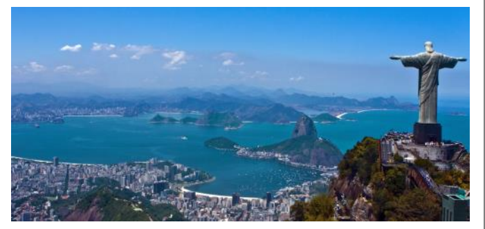
Christ the Redeemer, Rio de Janeiro, Brazil

I feel honored to share my "what The Urantia Book means to me " story with other readers.