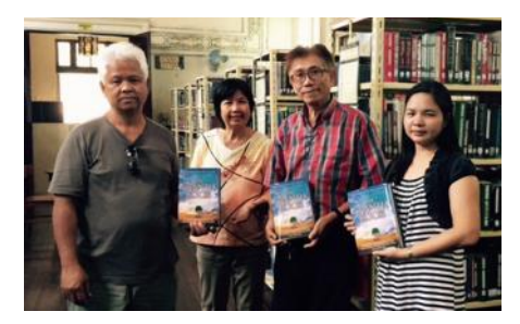
University of the Philippines Visayas