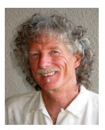
By James Woodward, California, United States

The Council for a Parliament of the World's Religions and The Urantia Book have some things in common. Both were inaugurated in Chicago; both