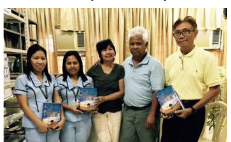
Central Philippine University