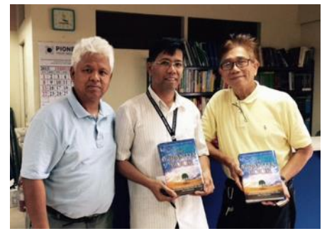
Philippine Science High School System