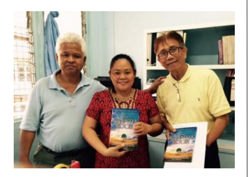
West Visayas State University