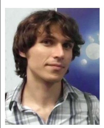
By Anton Miroshnichenko, Kyiv, Ukraine

The Urantia Association of Ukraine posted an announcement on their website, <a href="www.urantia.org.ua">www.urantia.org.ua</a>, that The Urantia Book is for sale. The announcement was also posted on all other free resources on the Internet: for example the OLX (ex slando) free classifieds <a href="kiev.ko.olx.ua/obyavlenie/kniga-urantii-IDcr3DR.html">kiev.ko.olx.ua/obyavlenie/kniga-urantii-IDcr3DR.html</a> and the Prom.ua online marketplace <a href="kiev.prom.ua/p28379988-kniga-urantii.html">kiev.prom.ua/p28379988-kniga-urantii.html</a>).