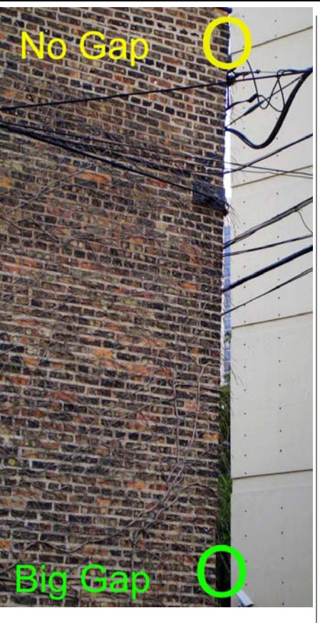
The leaning Carriage House

The spiritually hungry people in our world cry out for the transformative truths contained within our beloved Urantia Book .