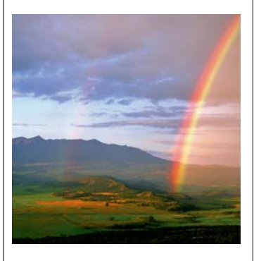
"I now know that peace will prevail. What a blessing!"