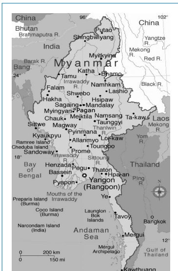
Burma, also known as Myanmar, is one of the world's most isolated societies.