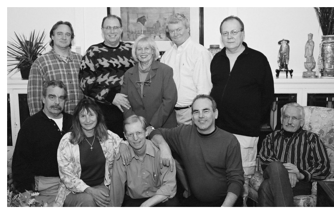
MEMBERS OF INTERNATIONAL SERVICE BOARD

In addition to this experience working with people of diverse backgrounds toward common goals, we also have the benefit of valuable lessons from The Urantia Book regarding the outworking of previous epochal revelations on our planet. The members of International Urantia Association have used this knowledge and experience and integrated it in a new organizational Charter.