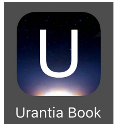
The Apple app

The number of downloads from urantia.org continues to increase. When you combine the number of downloads from our website with