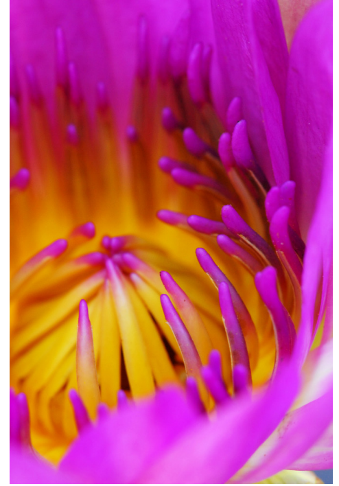
Lotus

The UBIS team invites you to enroll in a course this trimester. A Divine Counselor promised that "there dwells within the human mind a fragment of God, and that there sojourns with the human soul the Spirit of Truth; and we further know that these spirit forces conspire to enable material man to grasp the reality of spiritual values and to comprehend the philosophy of universe meanings. But even