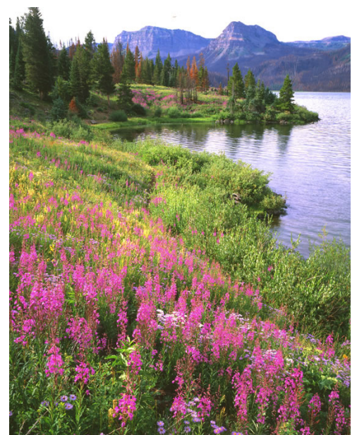
Trappers Lake Fireweed.

The UBIS team strongly supports volunteerism as an opportunity for unselfish