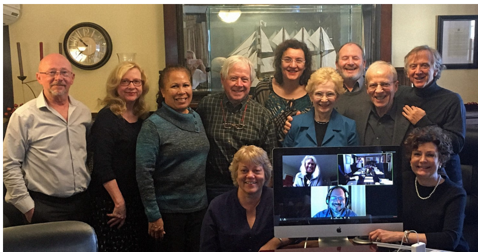
UBIS Board of Directors