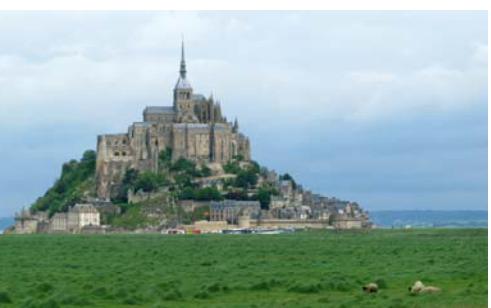
Le Mont Saint Michel

Sharing the Urantia Revelation across the globe is an uplifting and powerful experience. Cultural and linguistic differences seem to melt away when in the service of the Father. The dynamics of these meetings are incredible, and when people use their goodwill to act together, great things may and do happen.